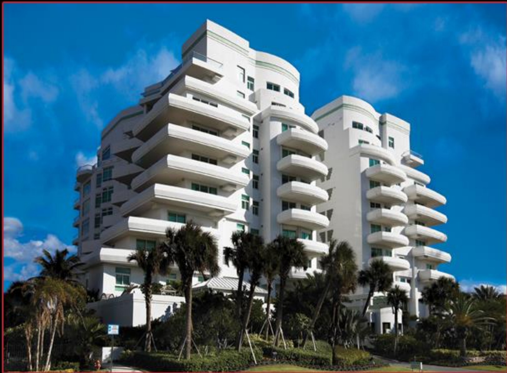
Arragon Condominium – Boca Raton, Florida