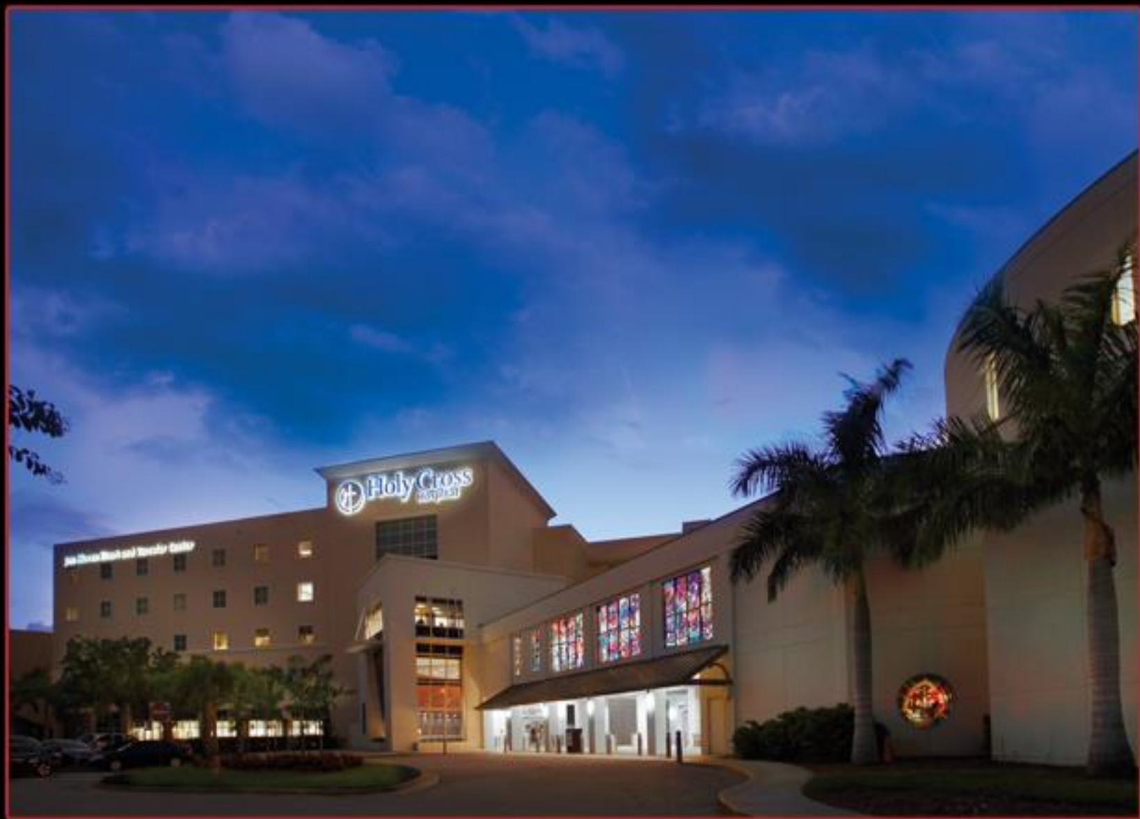
Holy Cross Hospital – Fort Lauderdale, Florida