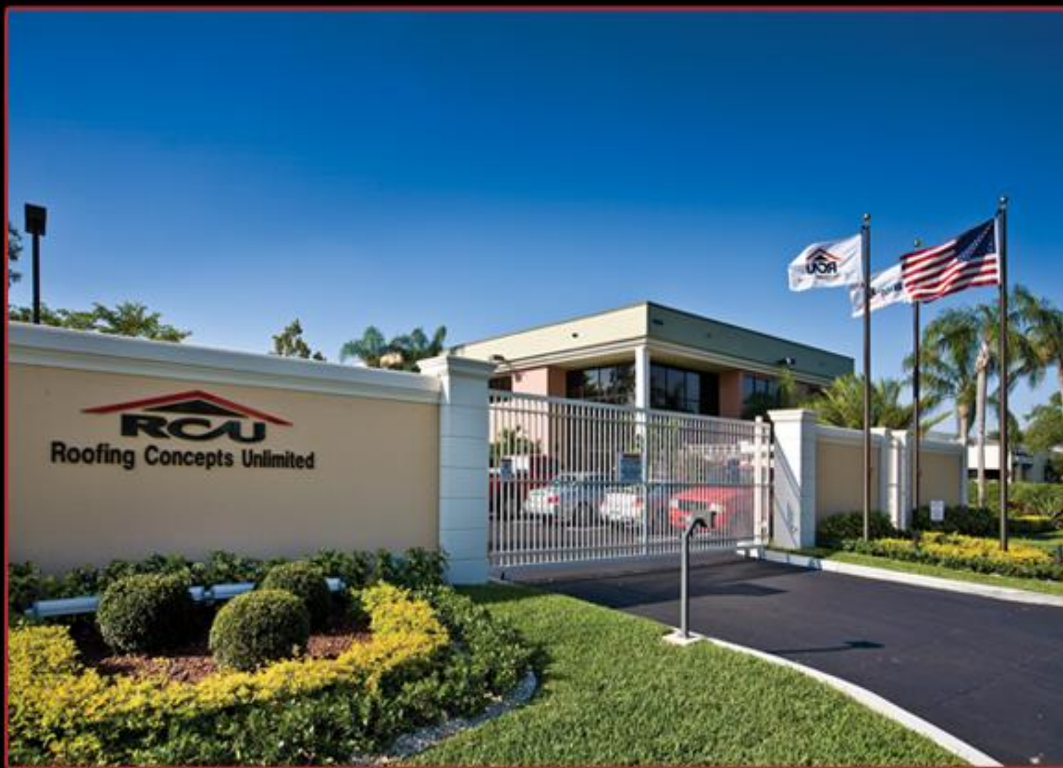
RCU Corporate Headquarters – Coral Springs, Florida