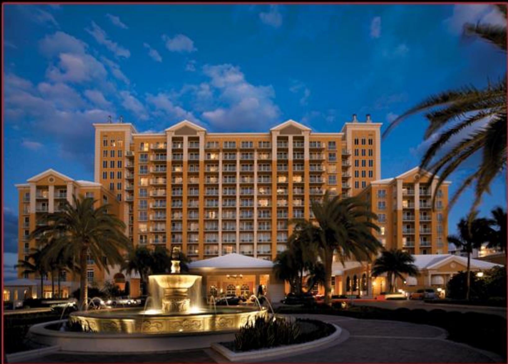
The Key Biscayne Ritz Carlton - Key Biscayne Florida