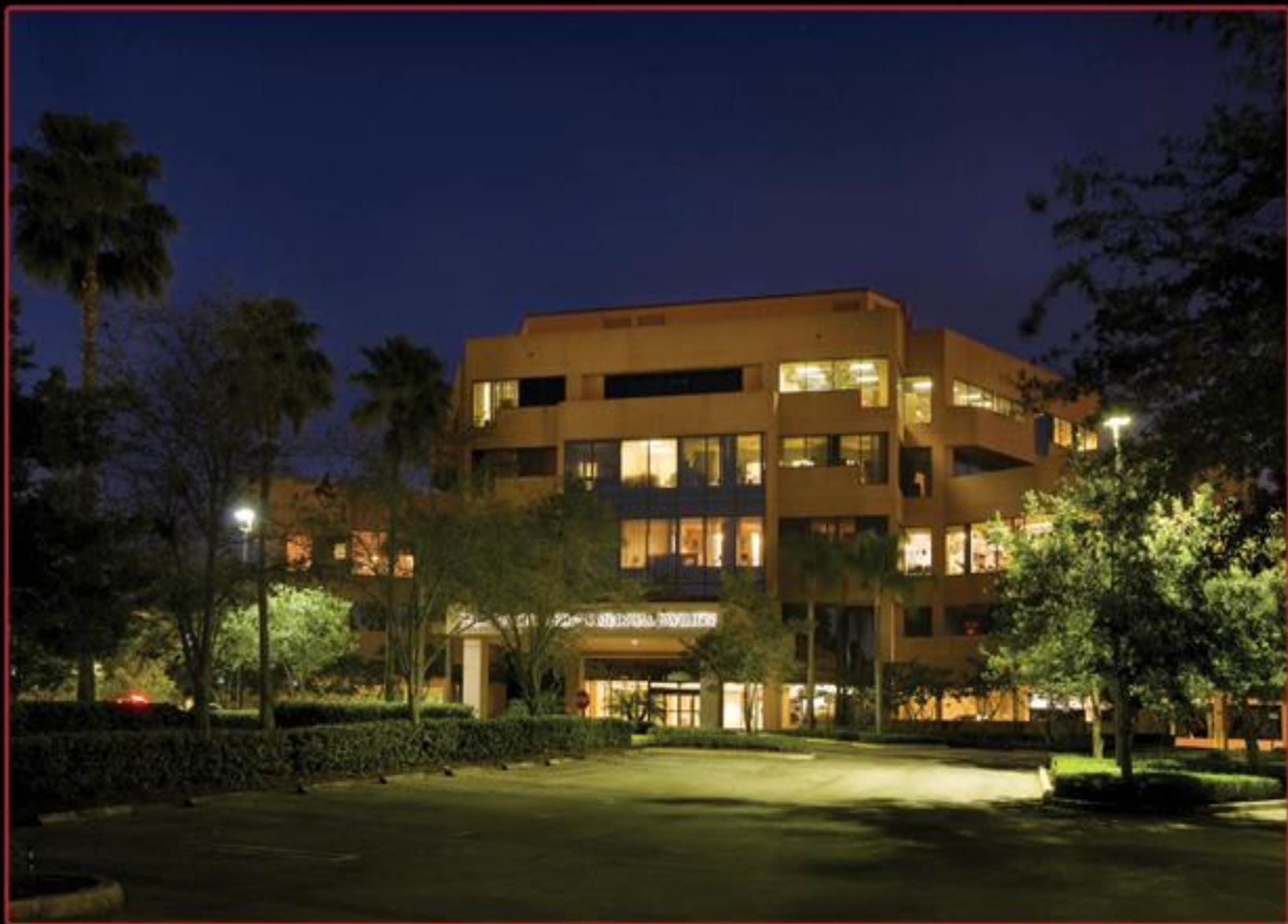
3401 PGA - Tenent Health Care – Palm Beach, Florida