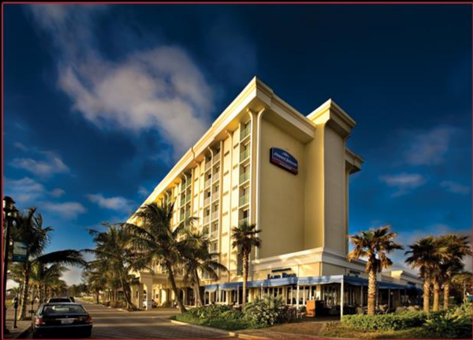
Howard Johnson's Plaza Resort - Deerfield Beach, Florida