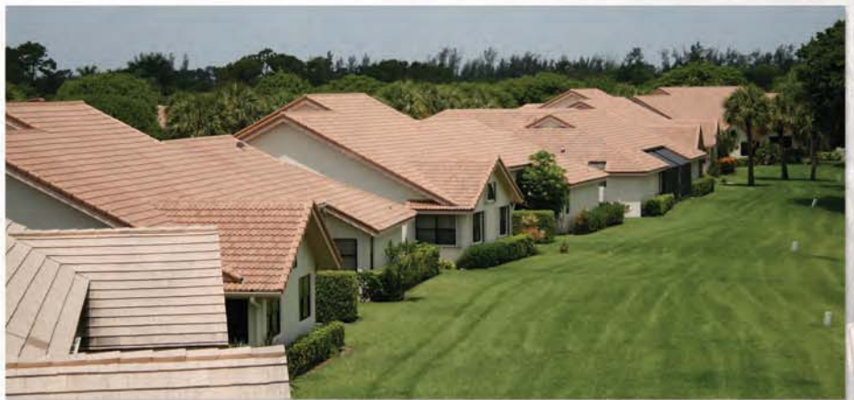
Tile Roofing System