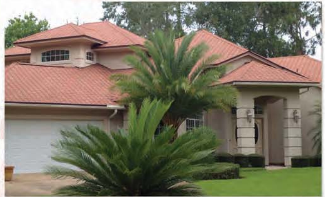
Shingle Roofing System