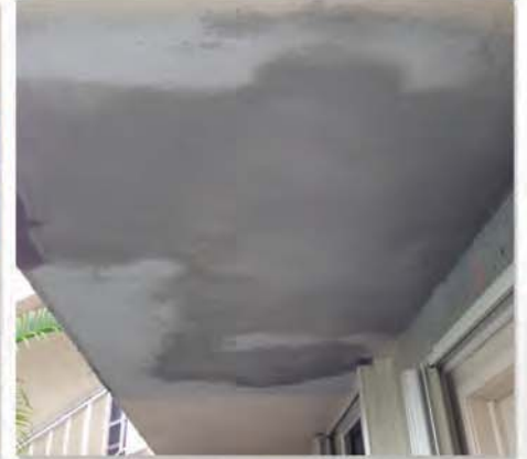
Concrete Restoration Progress Photos

Stucco is a widely recognized surface finish that protects the concrete or wood beneath and can provide attractive texture options like simulated brick, lath plaster and more.