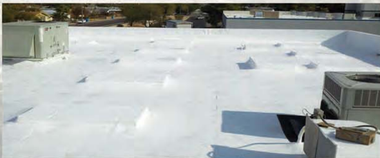
FPL Approved Commercial Roof Coating

GCL CONSTRUCTION GENERAL & ROOFING CONTRACTOR