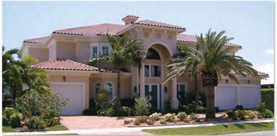
Custom Home Built by GCL