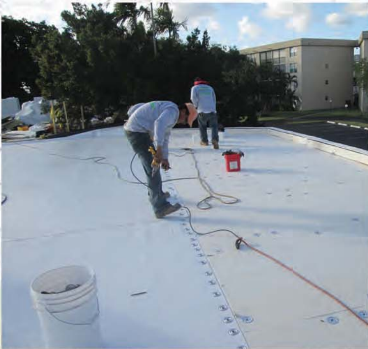
TPO Commercial Roofing

GCL also installs innovative spray foam and coatings that provide seamless insulation, waterproofing, and are fully adhered to the substrate. This eliminates the normal issues of leaks, pooling of water beneath roofing materials, and is an excellent alternative to roof replacement. This approach is weather resistant, cost effective, and meets the requirements for the FPL Rebate Program.