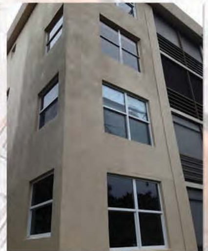
Concrete Restoration Progress Photos