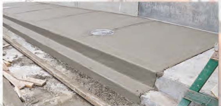
Concrete Sidewalk Curbing