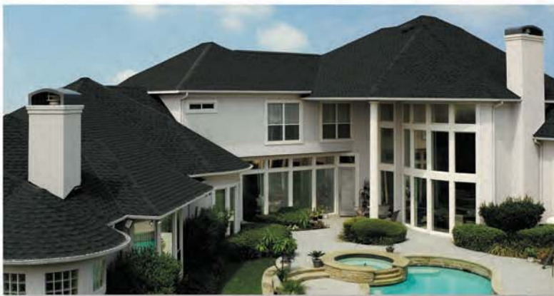
Shingle Roofing System