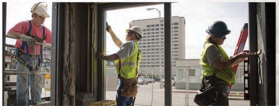
Impact Window Installation