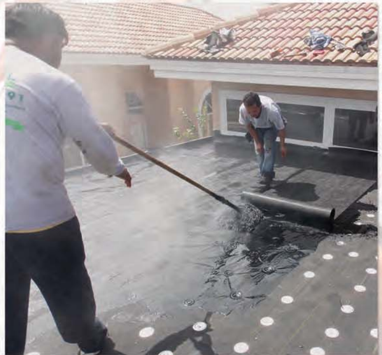
Modified Roofing System