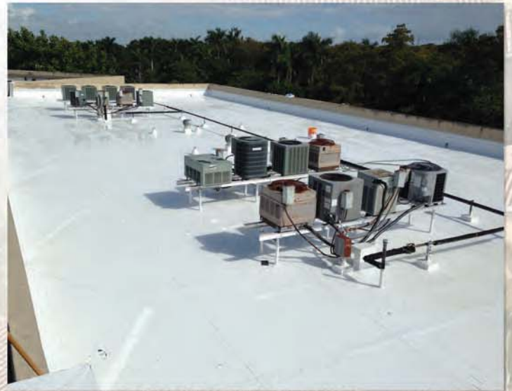
TPO Commercial Roofing