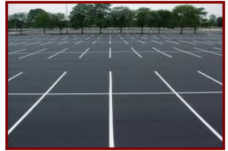
GFA's Asphalt Consulting expertise keeps big expenses down