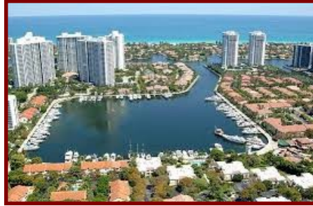
GFA has offered Environmental Services before "going green" was a buzz term