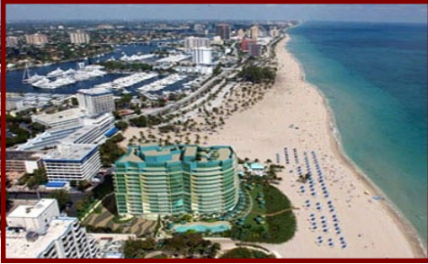
GFA's Parking Garage Assessments include long-term maintenance programs