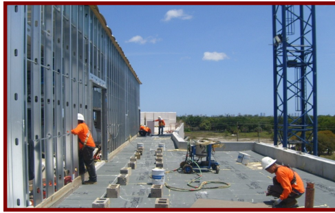
GFA's Roof Consulting Services offer numerous added-value benefits