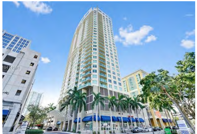
350 Las Olas Place Condominium 350 Southeast 2 nd Street Ft. Lauderdale, Florida 33301