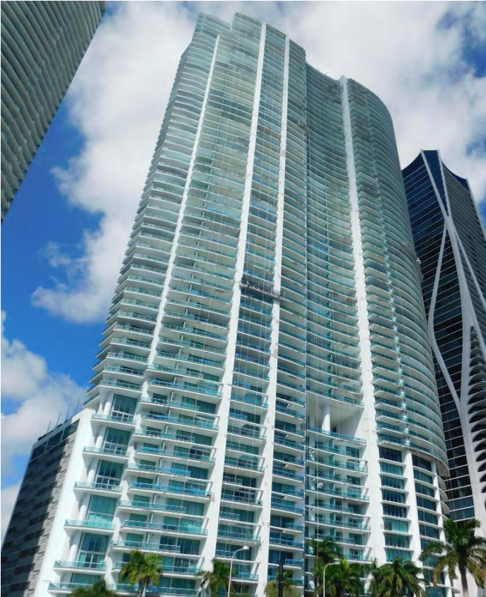
900 Biscayne Bay Condominium 900 Biscayne Boulevard Miami, Florida 33132

Inspections of concrete & post-tension repair/restoration and painting projects are provided to condominium clients and management companies. To obtain a permit for a concrete or post-tension restoration project on a threshold building, the FBC requires that structural inspections be performed by a Special Inspector for Threshold Buildings. In the State of Florida, less than 2% of registered Professional Engineers are certified as Special Inspectors. Three of our licensed Professional Engineers are also certified as Special Inspectors of Threshold Buildings.