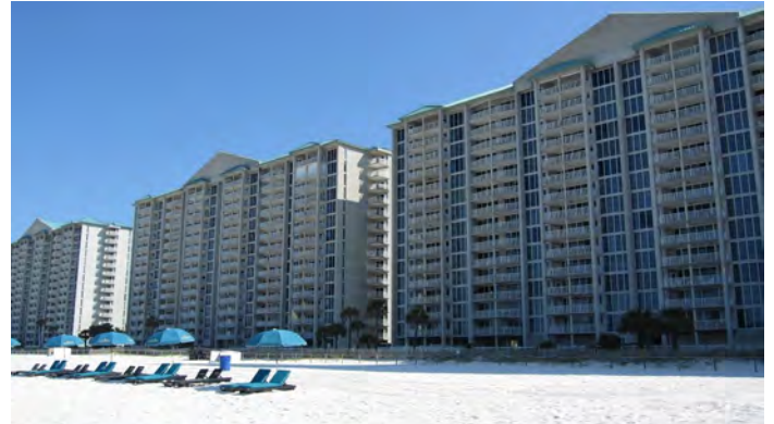
Long Beach Resort 10513 Front Beach Road Panama City Beach, Florida 32407