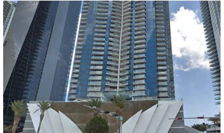
Jade Ocean Condominium 17121 Collins Avenue Sunny Isles, Florida 33160