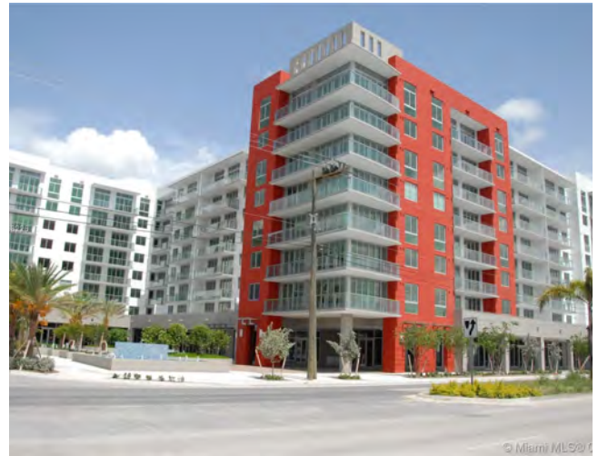
Midtown Doral Condominium 7761 NW 107th Avenue Doral, Florida 33178