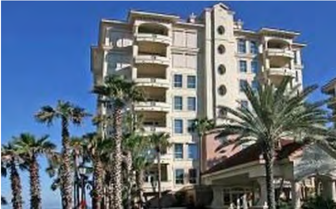
Carlton Dunes Condominium 4658 Carlton Dunes Drive Amelia Island, Florida 33034

These projects consist of repairs to exterior and interior of construction. Management consisting of review of construction activities and due diligence construction review.