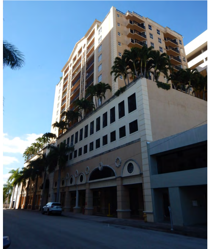
Almeria Park Condominium 337 Almeria Avenue Coral Gables, Florida 33134