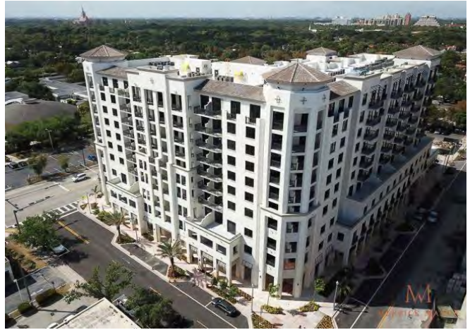
Merrick Manor Condominium 301 Altara Avenue Coral Gables, Florida 33146