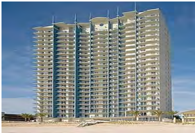
Sterling Breeze Condominium 16701 Front Beach Road Panama City, Florida 32413