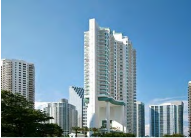
Asia Brickell Key Condominium 900 Brickell Key Boulevard Miami, Florida 33131

Expert testimony and investigation reports are provided to the attorneys and their clients based on construction inspection and analysis, design review, building code interpretation and other studies required by the unique circumstances of each specific client matter.