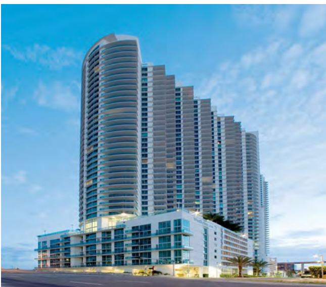
Wind Condominium 350 South Miami Avenue Miami, Florida 33130