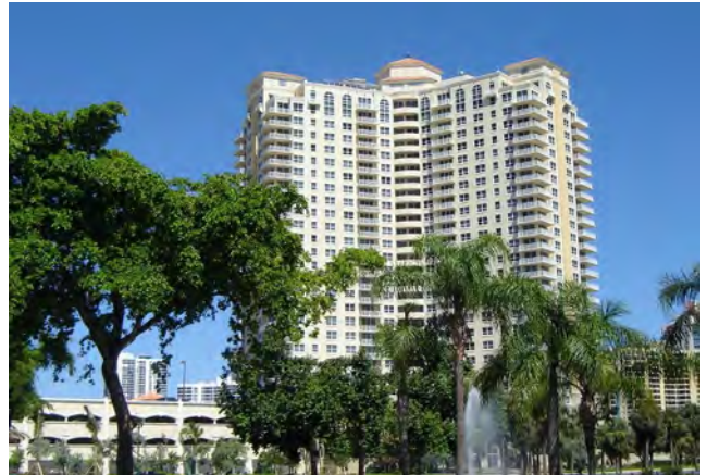
Turnberry On The Green 19501 West Country Club Drive Aventura, Florida 33180