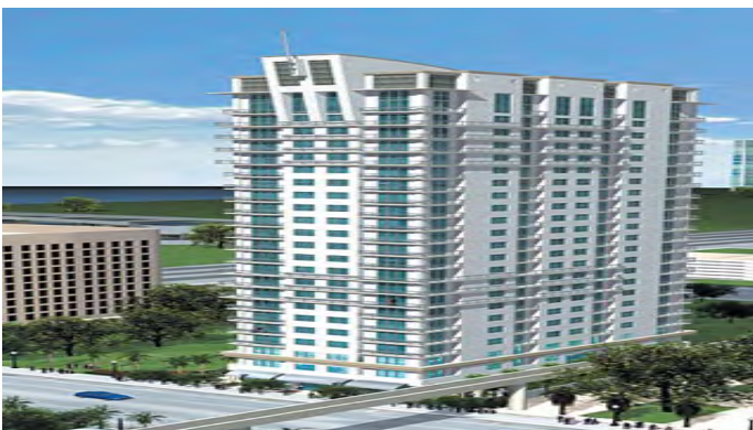
Loft Downtown I 234 Third Street Miami, Florida 33132