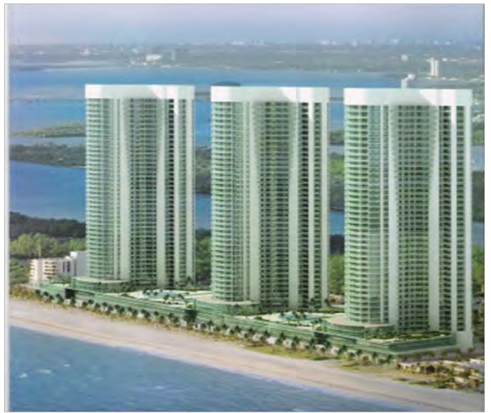
Trump Towers Condominium 15811 Collins Avenue Sunny Isles Beach, Florida 33160