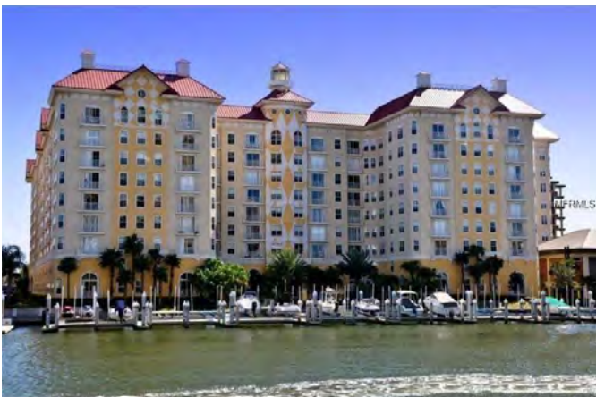
ParkCrest Harbour Island 700 South Harbour Island Boulevard Tampa, Florida 33602