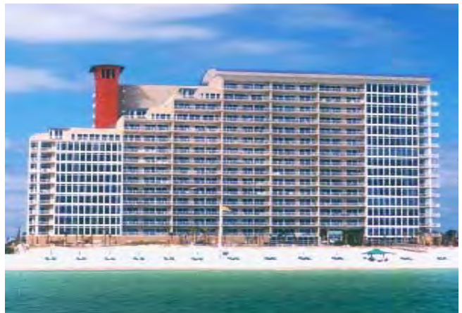
Sterling Beach Condominium 6627 Thomas Drive Panama City Beach, Florida 32408