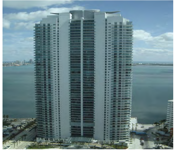
Jade Residences at Brickell Bay 1331 Brickell Bay Drive Miami, Florida 33131