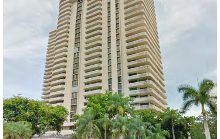
Turnberry Tower Condominium 19355 Turnberry Way Aventura, Florida 33180