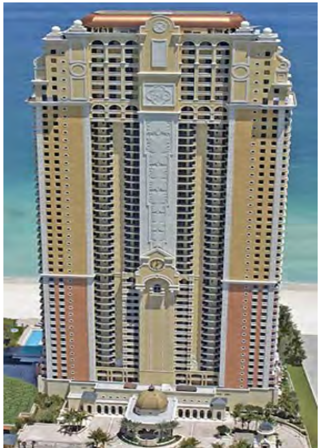
Acqualina Resort & Spa on the Beach 17875 Collins Avenue Sunny Isles Beach, Florida 33160