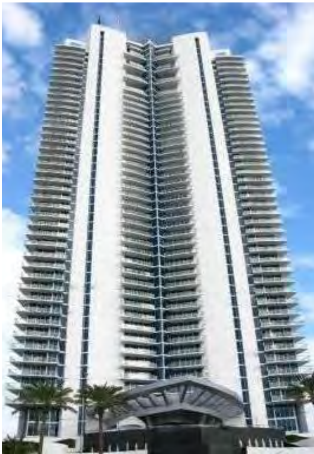
Jade Beach Condominium 17001 Collins Avenue Sunny Isles Beach, Florida 33160