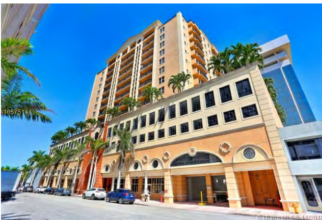
Almeria Park Condominium 337 Almeria Avenue Coral Gables, Florida 33134