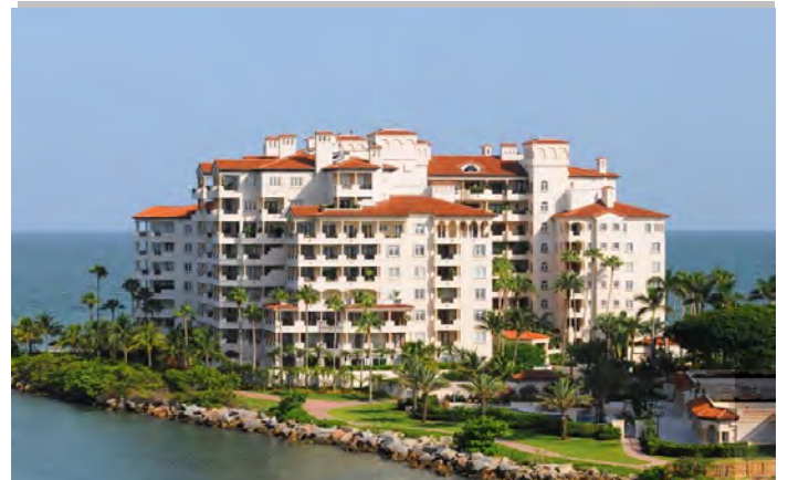
Fisher Island Condominium One Fisher Island Drive Fisher Island, Florida 33109