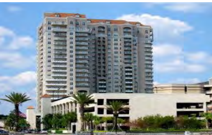
The Plaza Condominium 400 East Bay Street Jacksonville, Florida 32202