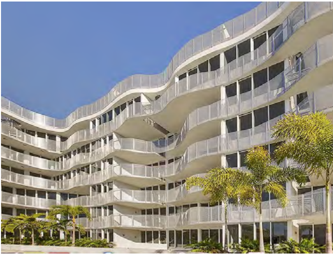
ArtePark North Condominium 2155 Washington Court Miami Beach, Florida 33139