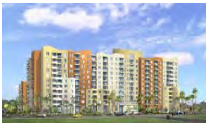
Venture at Aventura East 18800 Northeast 29 th Avenue Aventura, Florida 33180