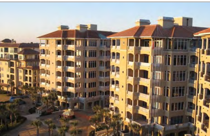
Dunes Club Condominium 1700 Dunes Club Place Amelia Island Plantation, Florida 32034