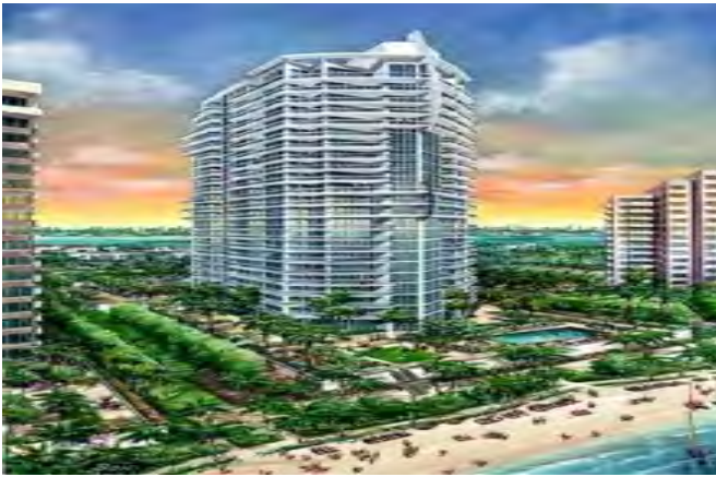
Bellini Condominium 10225 Collins Avenue Bal Harbour, Florida 33154