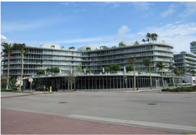
One Ocean Condominium One Collins Avenue Miami Beach, Florida 33139