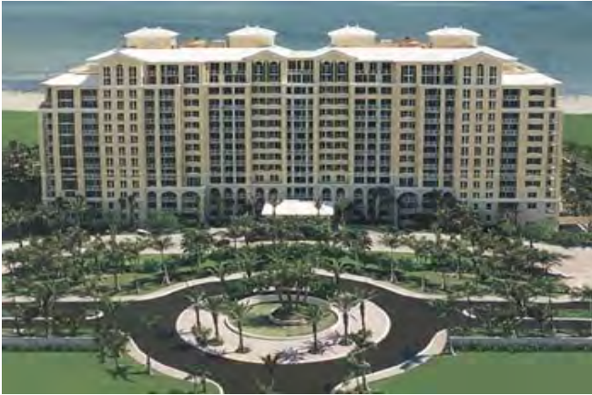
Grand Bay Residences 430 Grand Bay Drive Key Biscayne, Florida 33149