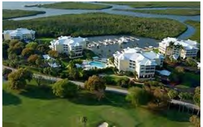
Harbour House Condominium Barracuda Lane Key Largo, FL 33037