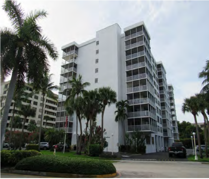
Island Breakers Condominium 150 Ocean Lane Drive Key Biscayne, FL 33149