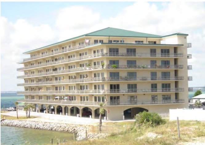
Sides Moreno Point West 5 Calhoun Avenue Destin, Florida 32541