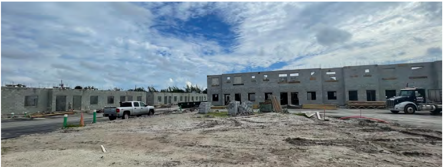
Oakland Park 1001 NE 58th Street Oakland Park, FL 33334