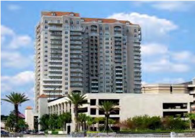
The Plaza Condominium 400 East Bay Street Jacksonville, Florida 32202