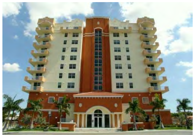
LeJeune Plaza Condominium 215 Southwest 42 nd Avenue Coral Gables, Florida 33134