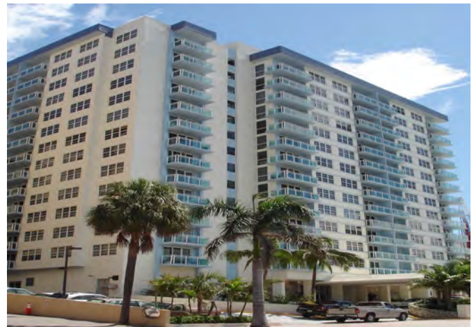
The Collins Condominium 6917 Collins Avenue Miami Beach, Florida 33141