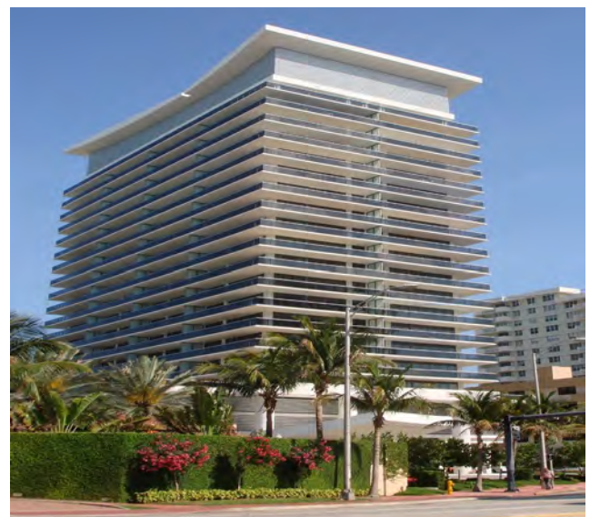
MEI Condominium 5875 Collins Avenue Miami Beach, Florida 33140