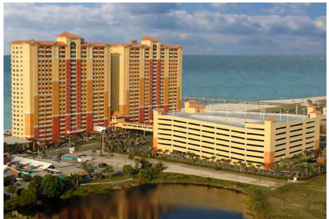
Calypso Tower Resort 15817 Front Beach Road Panama City Beach, Florida 32413