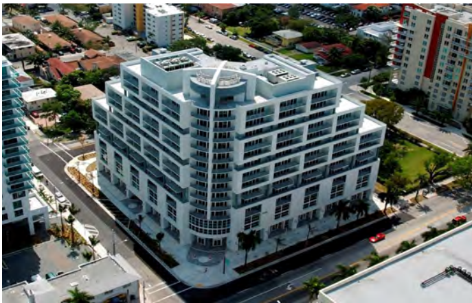
City 24 Condominium 350 NE 24th Street Miami, Florida 33137