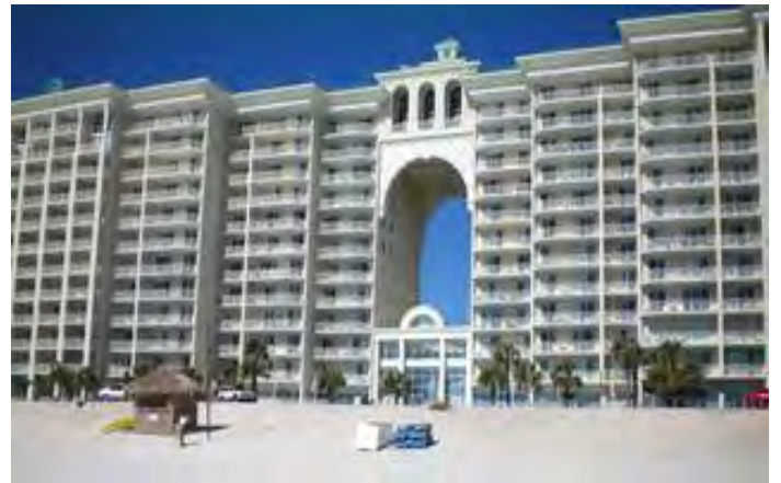
Majestic Sun Condominium 112 Seascape Drive Destin, Florida 32550