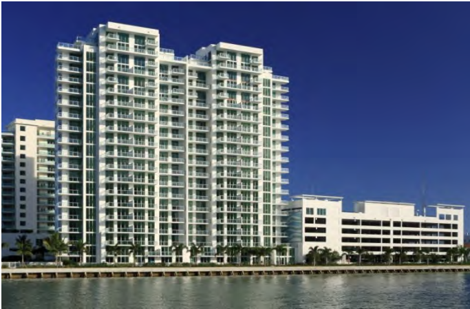
Eloquent On The Bay 7928 East Drive North Bay Village, Florida 33141

Services consists of identifying potential construction or design flaws. Review of drawings, specifications and conformance with applicable local building codes and industry standards.