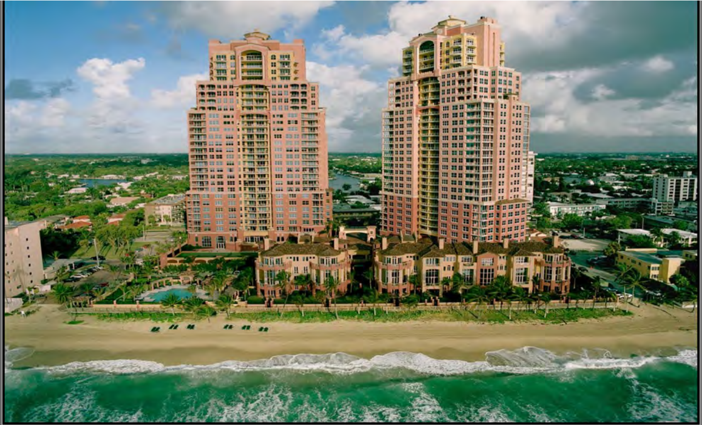
The Palms 2 - Condominium 2110 Ocean Boulevard Fort Lauderdale, Florida 33305

Structural and Civil engineering design services are provided for construction industry clients. This includes design and analysis for structural restoration and new projects.