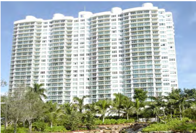
Hamptons South Condominium 20201 East Country Club Drive Aventura, Florida 33180