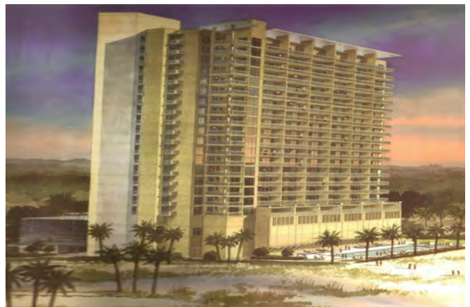
Sterling Reef Condominium 12011 Front Beach Road Panama City Beach, Florida 32407