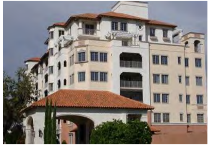
The Residences of Winter Park 300 South Interlachen Avenue Winter Park, Florida 32789