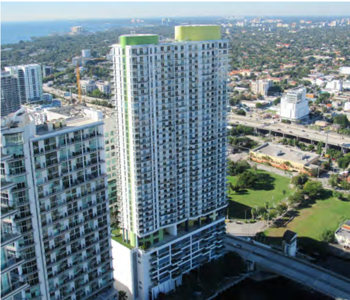
Latitude on the River Condominium 185 SW 7th Street Miami, FL 33130