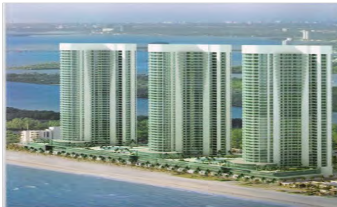
Trump Towers Condominium 15811 Collins Avenue Sunny Isles Beach, Florida 33160