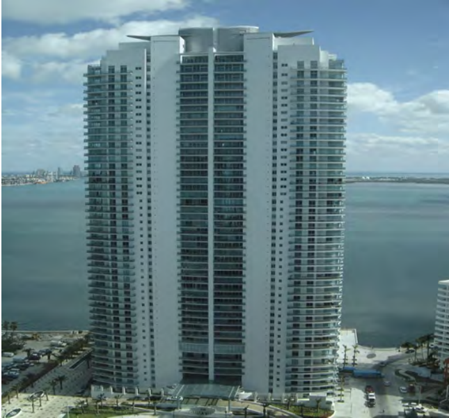
Jade Residences at Brickell Bay 1331 Brickell Bay Drive Miami, Florida 33131

Inspection services and reports are provided to the construction industry, real estate investors, developers, and management companies. The level of inspection is designed to fit each individual situation and may include a review of the structure; the building envelope including roofing, windows, walls, and waterproofing; and an overview of the mechanical and electrical systems. Threshold Structural Inspections are made and reports issued for construction industry clients. Reports on due diligence inspections are provided to real estate industry clients.