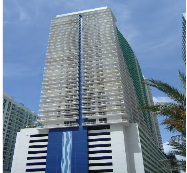
The Club At Brickell Bay 1200 Brickell Bay Drive Miami, Florida 33131