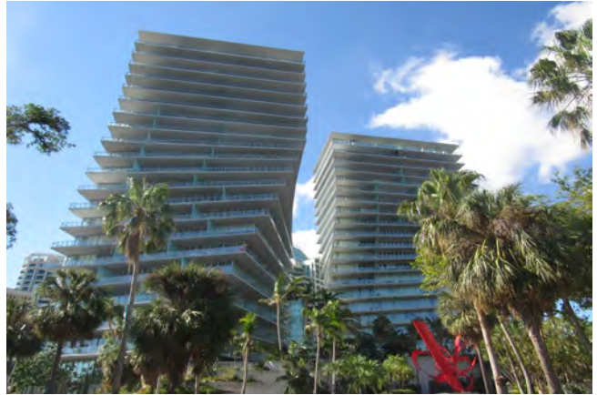
Grove at Grand Bay Condominium 2669 South Bayshore Drive Coconut Grove, Florida 33133