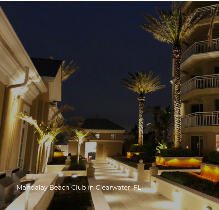
Mandalay Beach Club in Clearwater, FL

Poli LED & Signs (305) 384-7550 sales@poliledsigns.com