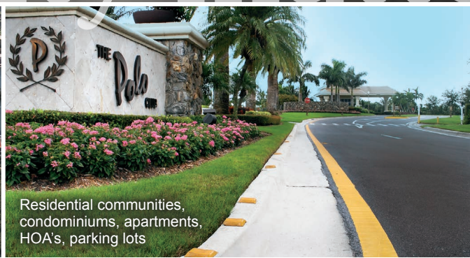
Residential communities, condominiums, apartments, HOA's, parking lots