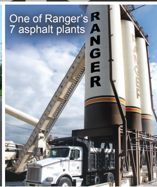
One of Ranger's 7 asphalt plants