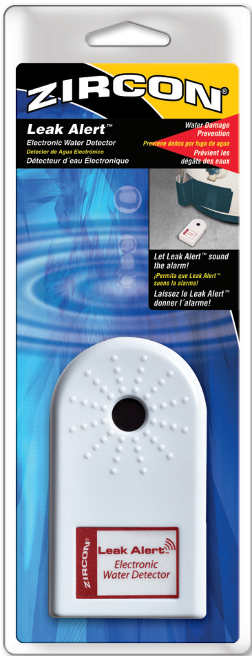
Leak Alert™ 1 pk Zircon PN #64003