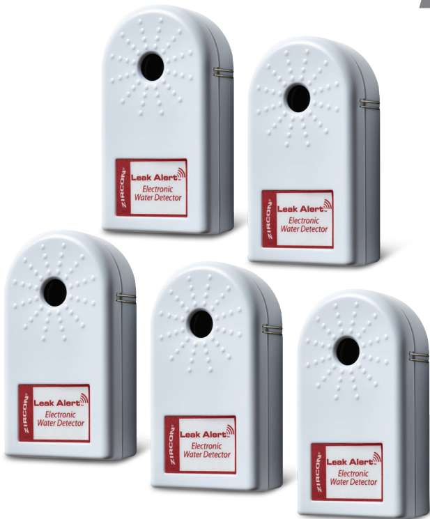
Leak Alert™ 5 pk Zircon PN #69149